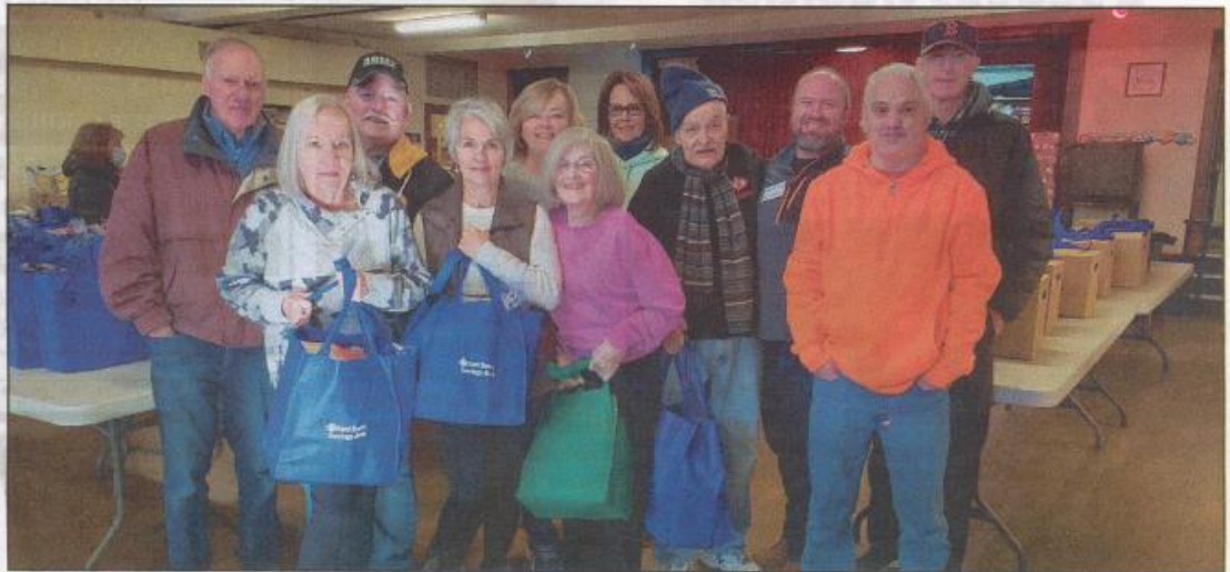
The Team: many of the volunteers who pitched in to help the Saugus United Parish Food Pantry's annual Thanksgiving food drive last Saturday.

Volunteers – including members of the Saugus High School Sachems football 'squad' and students from Saugus Public Schools and neighboring communities – assembled for four hours in the basement of Cliftdale Congregational Church last Saturday (Nov. 19) to continue the town's tradition of the Saugus United Parish Food Pantry's annual Thanksgiving food drive that makes the holiday special for local families who might not have a Thanksgiving Day meal. Each needy family that registered for the Thanksgiving Day meal received a turkey, fresh produce and other staples: boxed stuffing mix, boxed mashed potatoes, canned gravy, cranberry sauce and other food