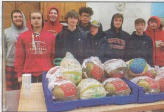
About a dozen Saugus High School Sachems football players turned out last Saturday to help deliver close to 100 turkey meals to needy Saugus and area homes. Here they are in the kitchen with the turkeys donated to needy families during the Saugus United Parish Food Pantry's annual Thanksgiving food drive.

to complete the meal. Families came by taxi and car to receive their meal donated by the food pantry, Saugus community and other contributors.